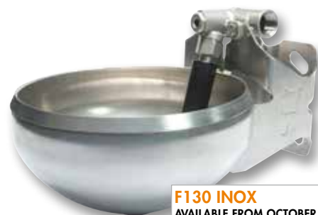
F130 INOX AVAILABLE FROM OCTOBER 2016 - REF 3217

Note that the F110 Inox is still connected to the water supply from the top, while the F130 Inox allows multidirectional water connection. It is compatible with antifreeze circulation installations equipped with a SPEEDFLOW or other pump. These two options meet the needs of all livestock farms.