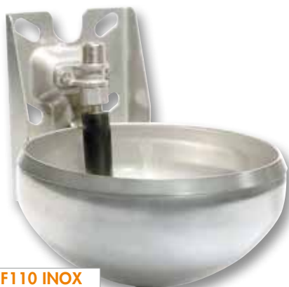
F110 INOX REF 3209

The F110 and F130 drinking bowls have been appreciated by the breeders for over more than 10 years now. But in their constant search for solutions that are adapted to the needs of the livestock farms, LA BUVETTE's research and development teams have listened to the concerns of the breeders to come up with a new design for these two existing drinking bowls enhancing the experience of the breeders and their animals.